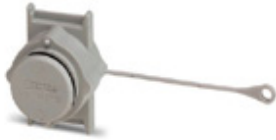
Protective cover, IP67, tall design, irradiated for welding applications

Please be informed that the data shown in this PDF Document is generated from our Online Catalog. Please find the complete data in the user's documentation. Our General Terms of Use for Downloads are valid ( http://download.phoenixcontact.com )