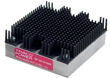
(Models pictured with optional heatsink)

The TEP 160 Series is a family of isolated high performance dc-dc converter modules with wide 2:1 input voltage ranges which come in a rugged, sealed industry standard half brick package.