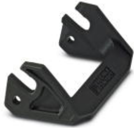
Single locking latch for B10 housing, HC-EVO....AL and HC-STA....AL

Please be informed that the data shown in this PDF Document is generated from our Online Catalog. Please find the complete data in the user's documentation. Our General Terms of Use for Downloads are valid ( http://phoenixcontact.com/download )